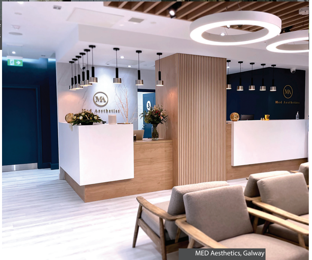
MED Aesthetics, Galway