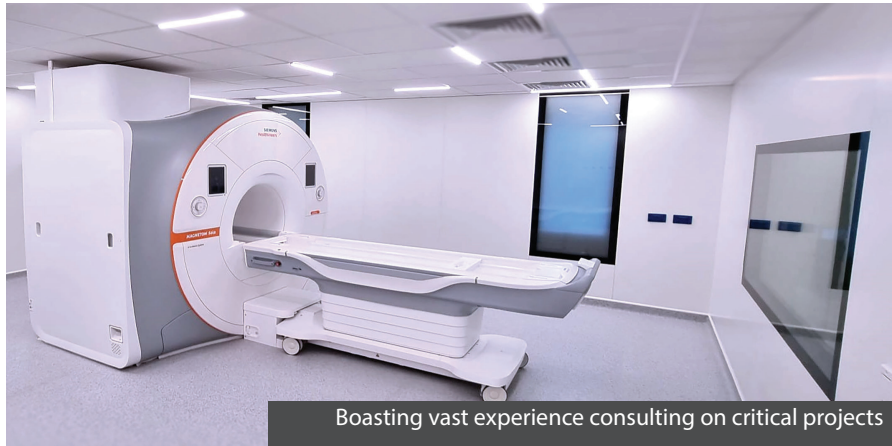
Boasting vast experience consulting on critical projects

Understanding deep collaboration with project architects, structural engineers, civil engineers and fire engineers, MARSON base their project designs on established and emerging design principles to ensure that they are fully futureproofed.