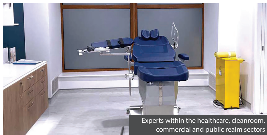
Experts within the healthcare, cleanroom, commercial and public realm sectors

Developing strong relationships enables MARSON to benefit from a steady volume of repeat business with established, long-term clients. “Essentially, 80% of work is based on repeat business, which demonstrates that we are giving our clients a good service,” says