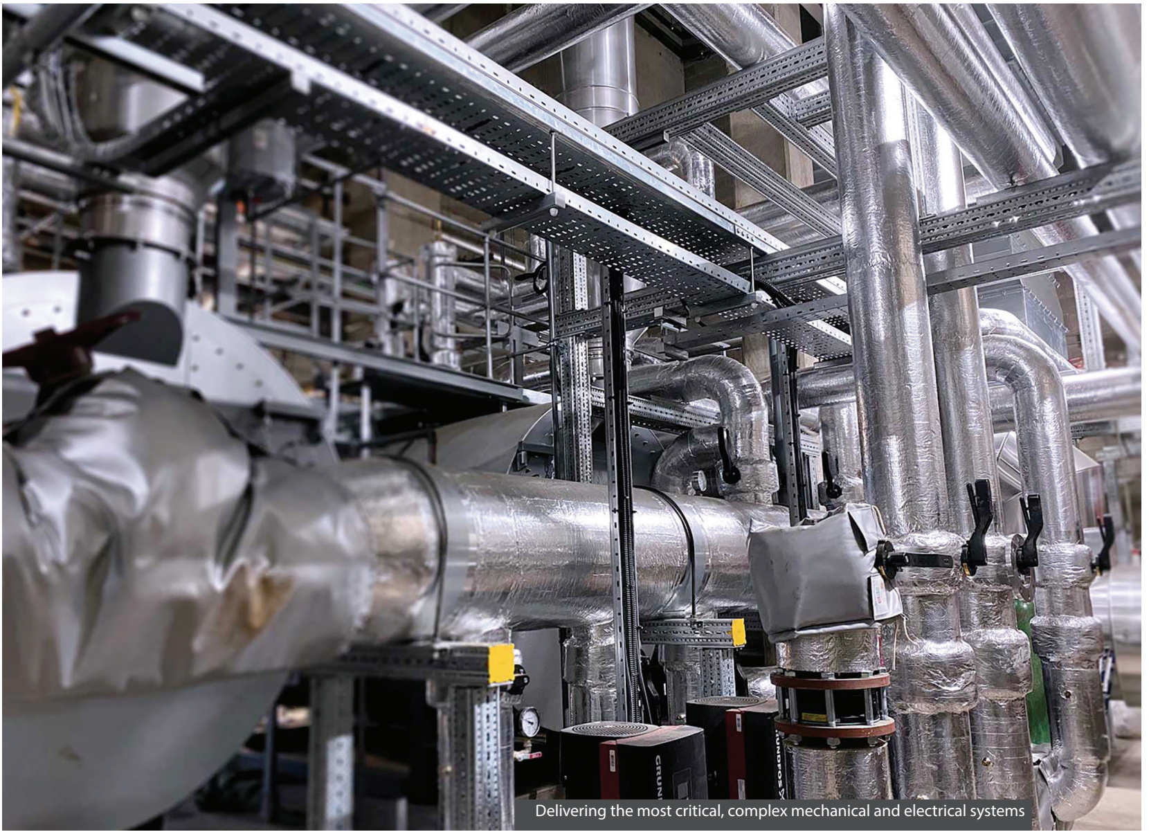
Delivering the most critical, complex mechanical and electrical systems