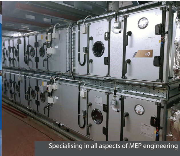
Specialising in all aspects of MEP engineering

these emergency projects to do our bit for the National Effort.”